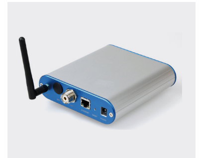
Coloured end panels available upon request