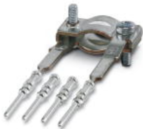
Shield connection, for a shielded line on male contact carriers, incl. two loose crimp contacts for PROFIBUS line

Please be informed that the data shown in this PDF Document is generated from our Online Catalog. Please find the complete data in the user's documentation. Our General Terms of Use for Downloads are valid ( http://phoenixcontact.com/download )