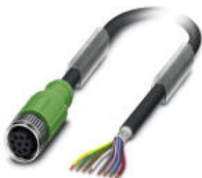
Sensor/actuator cable, 8-position, PUR halogen-free, black-gray RAL 7021, shielded, free cable end, on Socket straight M12, A-coded, cable length: 10 m

Please be informed that the data shown in this PDF Document is generated from our Online Catalog. Please find the complete data in the user's documentation. Our General Terms of Use for Downloads are valid ( http://phoenixcontact.com/download )